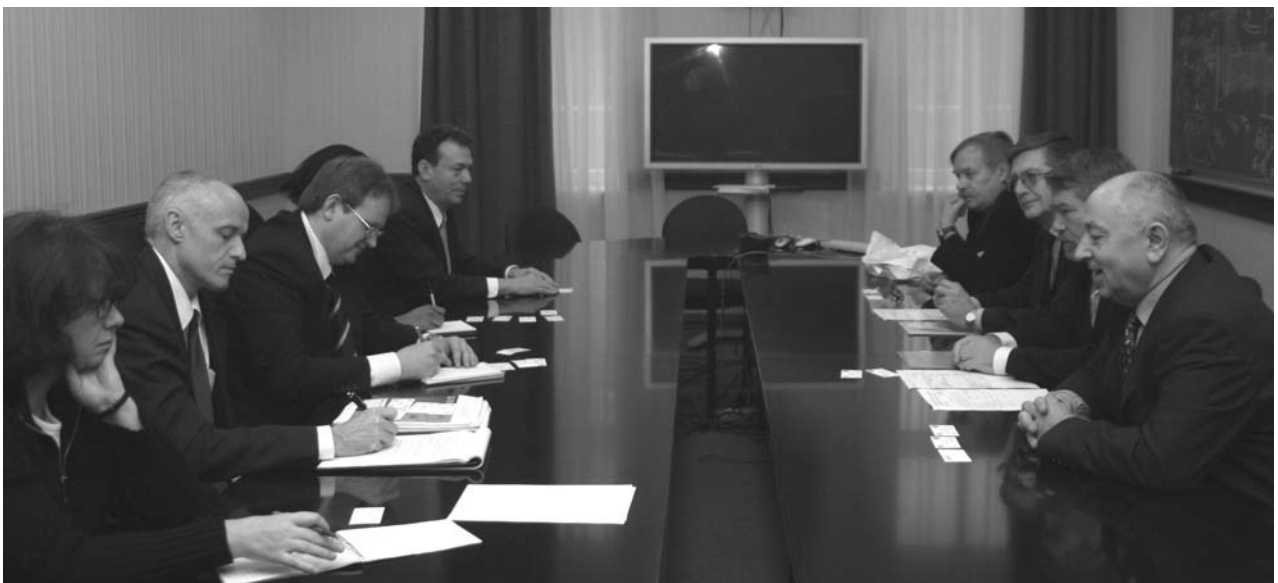
Dubna, 4 December. A delegation from the US Department of Energy on a visit to JINR