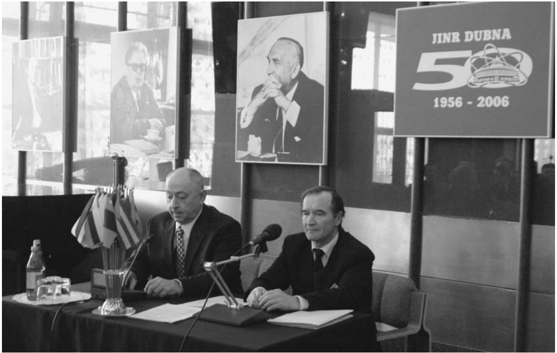
Dubna, 25 March. Presentation of letters of congratulation and souvenirs and awarding of JINR staff members on the occasion of the Institute's jubilee