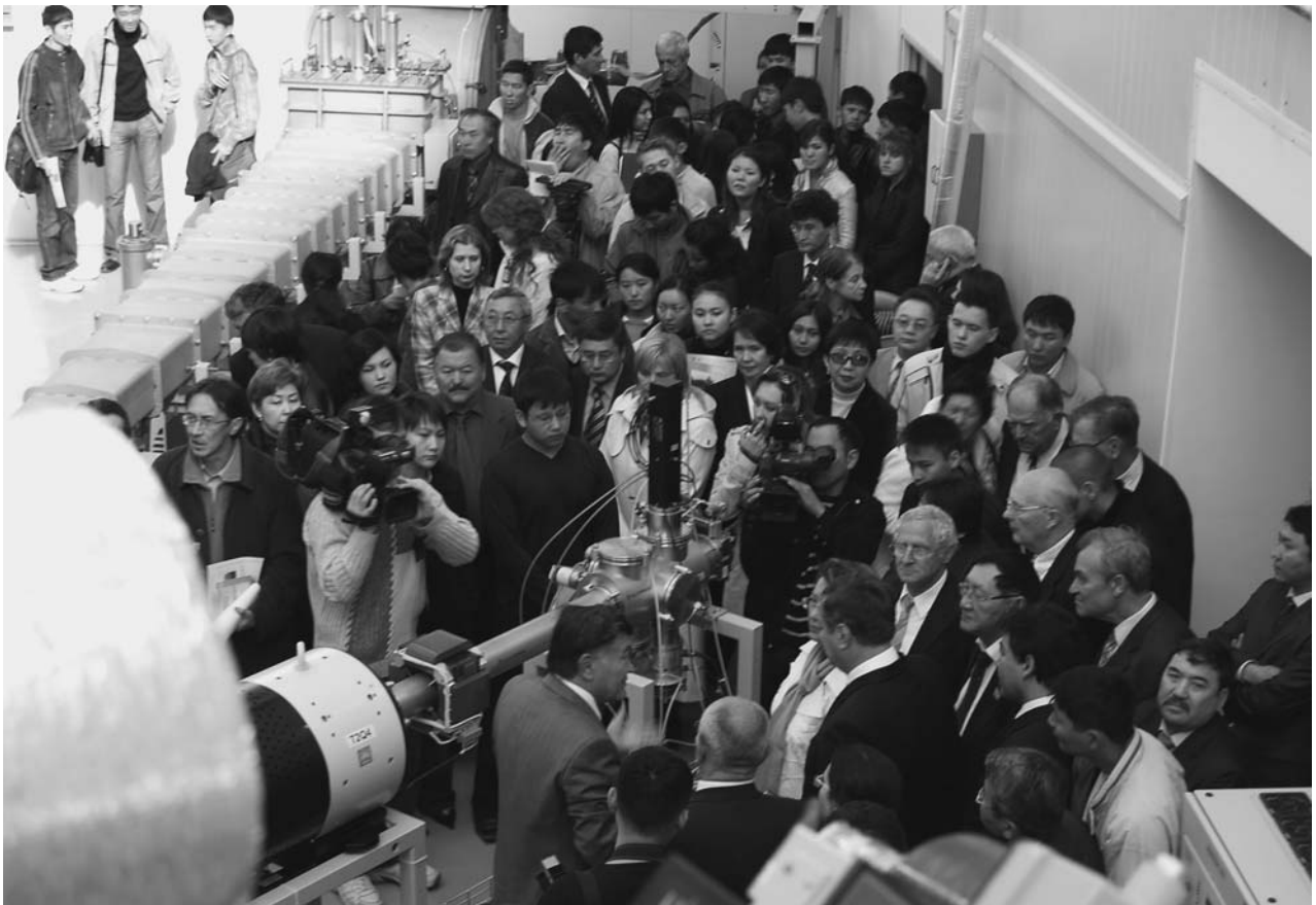
Astana (Kazakhstan), 21 September. The inauguration ceremony of the Interdisciplinary Scientific Research Complex on the basis of the DC-60 heavy ion cyclotron at the Gumilev Eurasian University