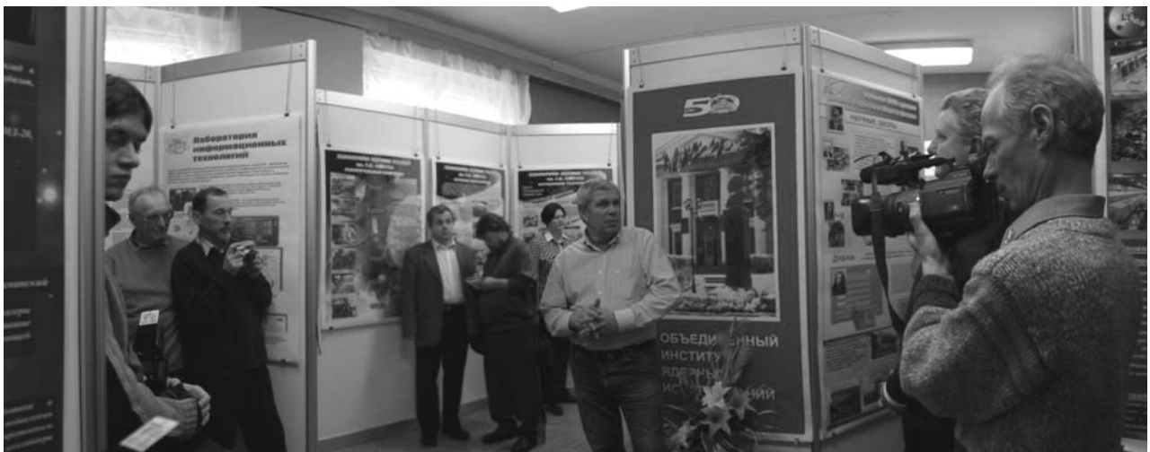
Dubna, JINR Museum, 28 March. Opening of the exhibition «50th Anniversary of JINR: Stages of Development and Major Scientific Achievements»