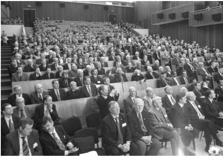
Dubna, 26 March. Ceremonial meeting of the Committee of Plenipotentiaries and the JINR Scientific Council dedicated to the 50th anniversary of JINR