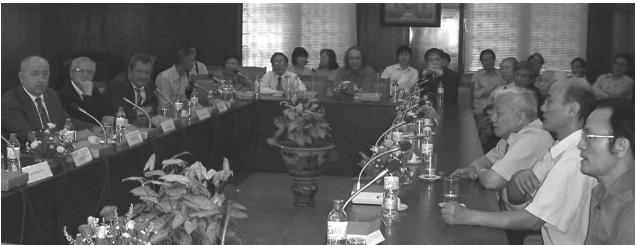
Hanoi (Vietnam), 6 November. Ceremonial meeting dedicated to the 50th anniversary of the Joint Institute for Nuclear Research