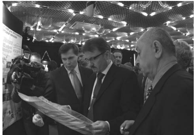
Dubna, 26 December. RF Minister of Economic Development and Trade G. Gref is acquainted with innovation elaborations of JINR scientists during the meeting on the establishment of a special economic zone in Dubna