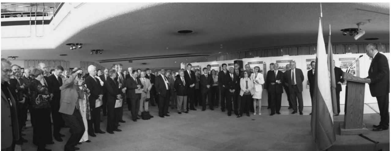
Geneva (Switzerland), 25–28 April. CERN–JINR exhibition «Science Bringing Nations Together»