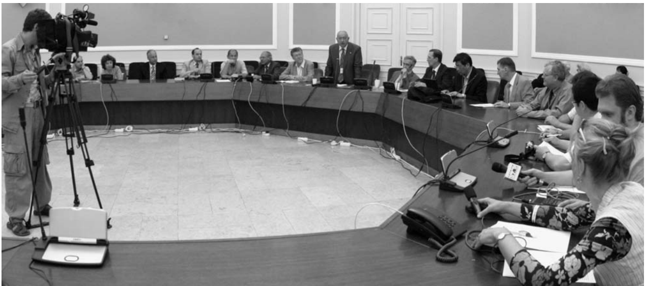
Moscow, 27 July. A press conference upon the opening of XXXIII International Conference on High Energy Physics (ICHEP'06)