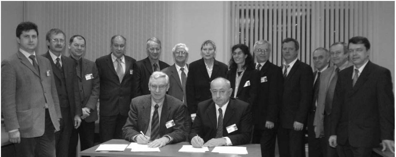
Dubna, 20 February. Participants of the 16th meeting of the Coordinating Board for BMBF–JINR cooperation. Signing a Protocol on cooperation in 2006