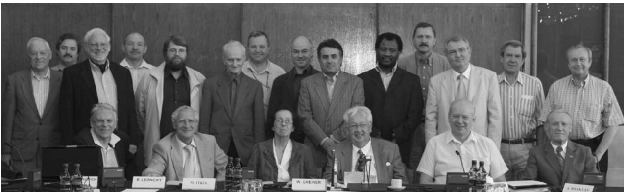
Dubna, 19–20 June. Meeting of the Programme Advisory Committee for Nuclear Physics