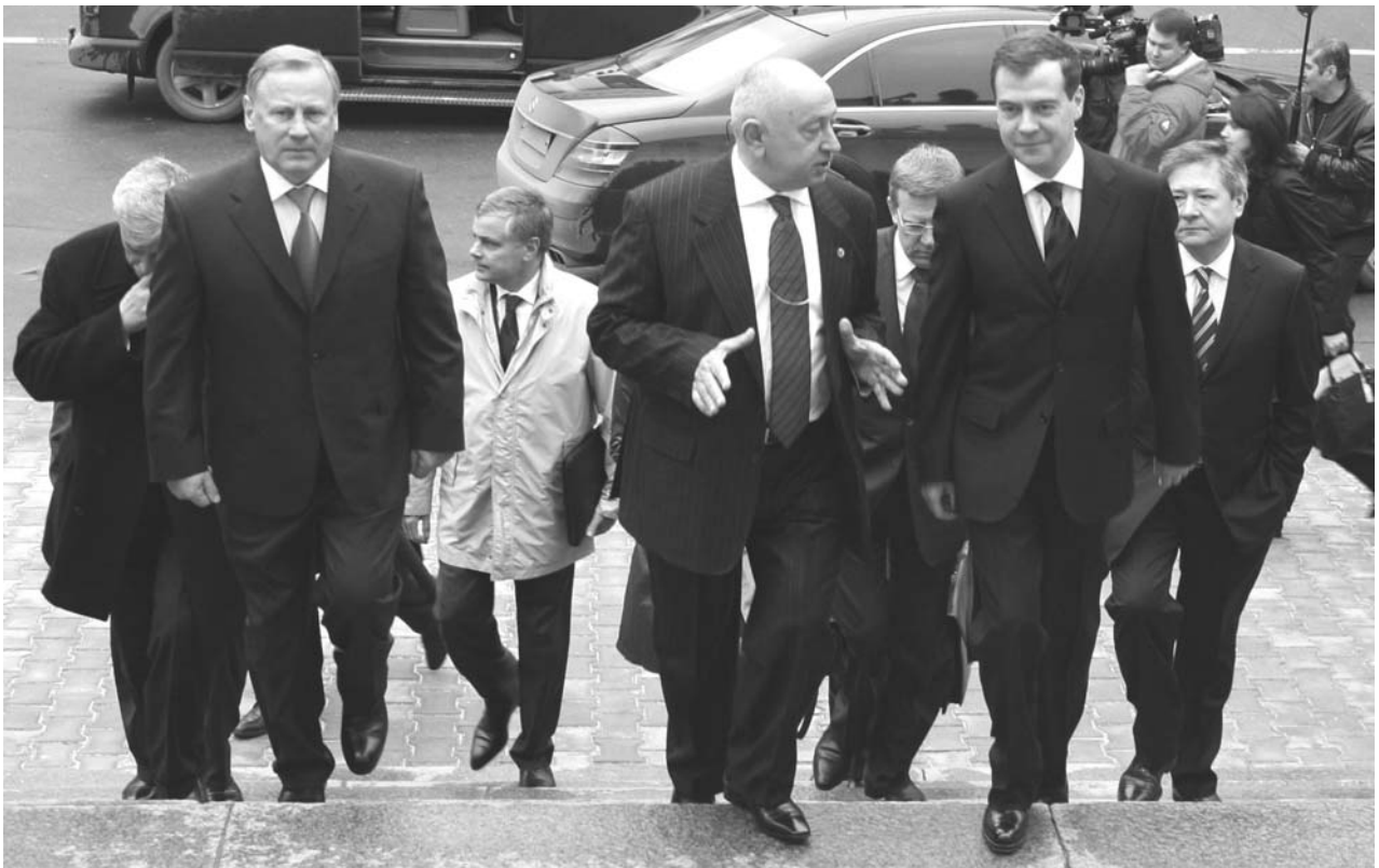
Dubna, 18 April. RF President D. Medvedev (right) on a visit to JINR. At the porch of the Flerov Laboratory of Nuclear Reactions