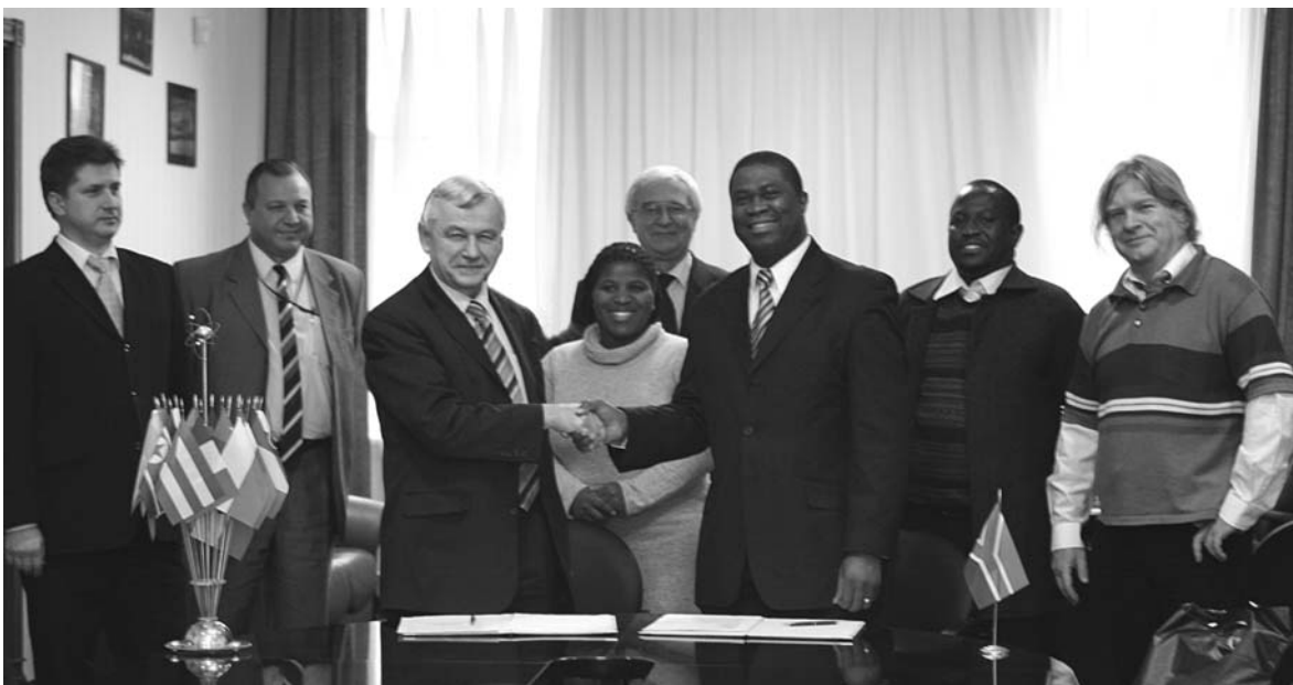
Dubna, 14 November. Participants of the 6th Coordinating Committee on JINR–RSA cooperation