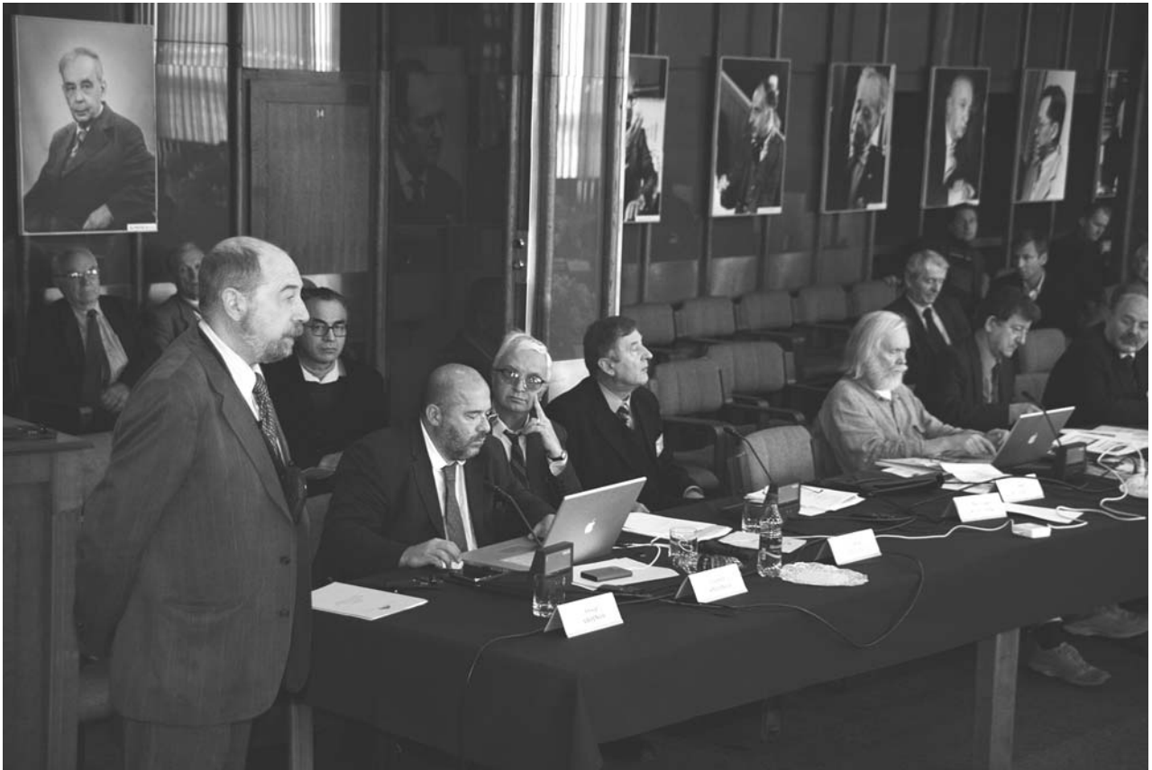
Dubna, 21–22 February. The 103rd session of the JINR Scientific Council