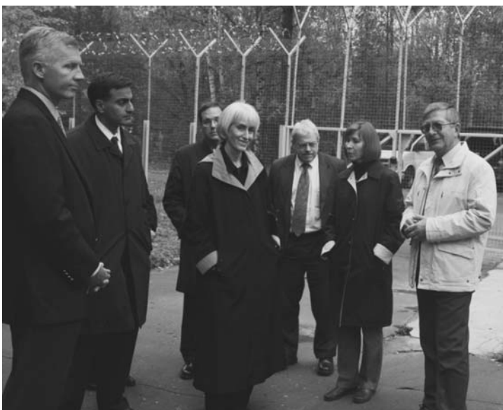
Dubna, 24 September. A delegation of the US Congress Commission on the Prevention of Weapons of Mass Destruction Proliferation and Terrorism headed by Ambassador Wendy R. Sherman (in the centre) on a visit to JINR