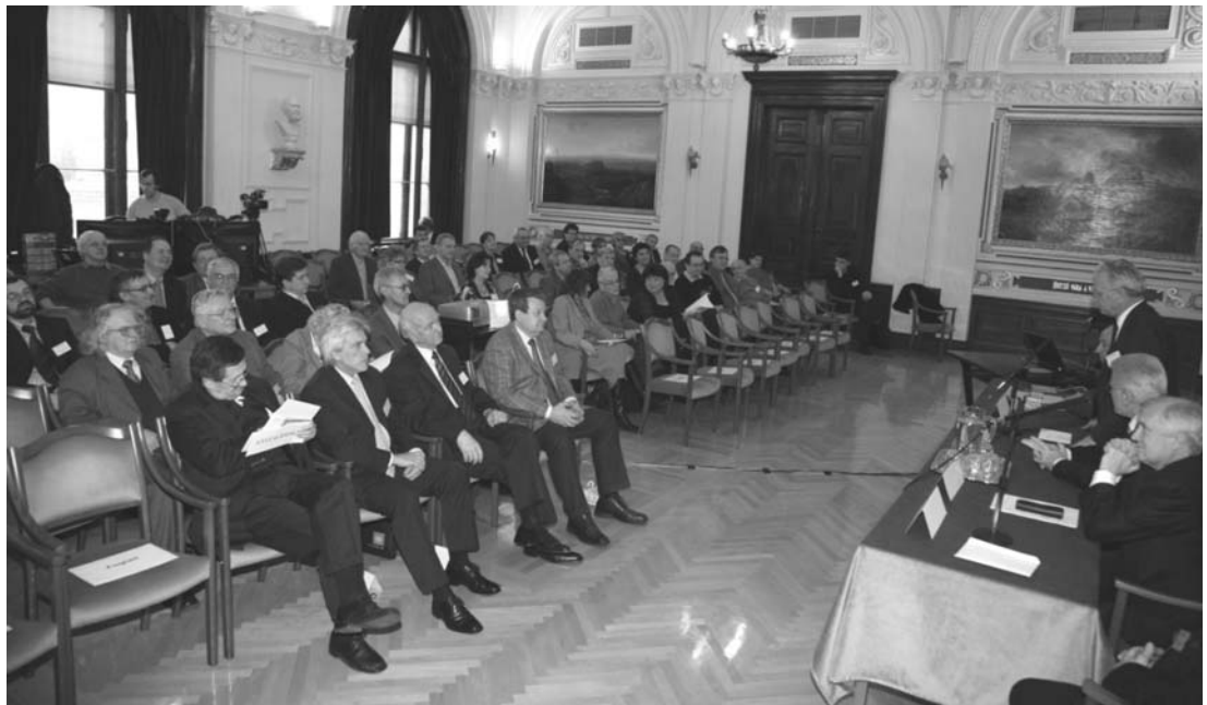
Budapest (Hungary), 3–7 December. JINR Days in Hungary as part of the JINR cooperation with the Hungarian Academy of Sciences