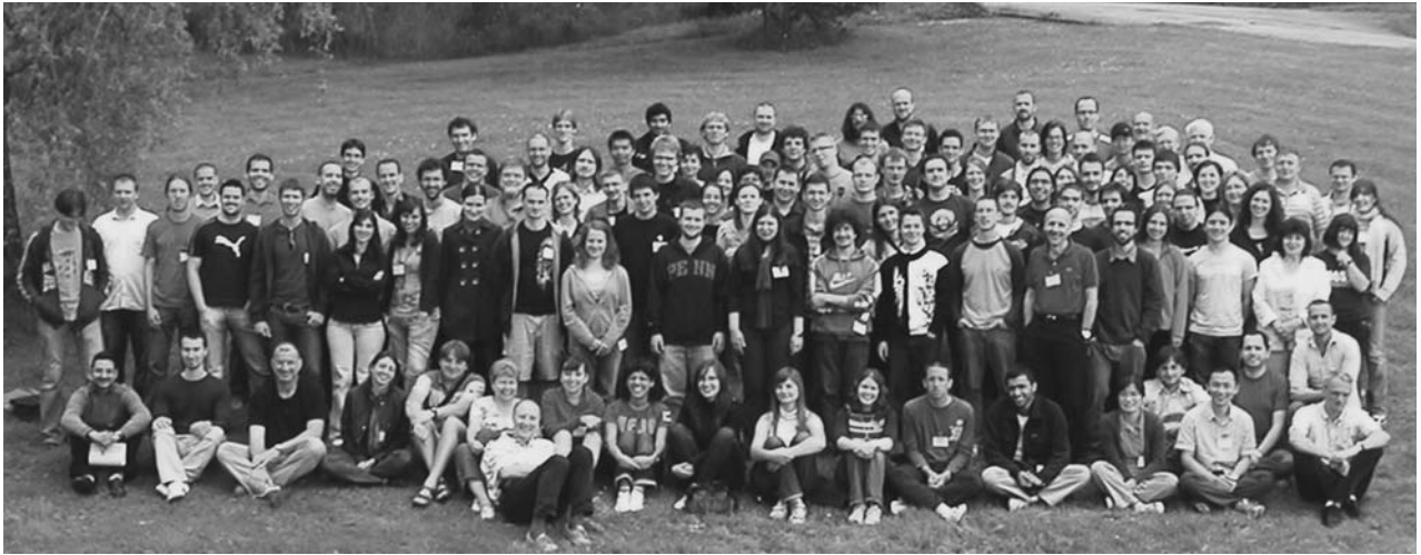
Herbeumont-sur-Semois (Belgium), 8–21 June. Participants of the European School on High Energy Physics