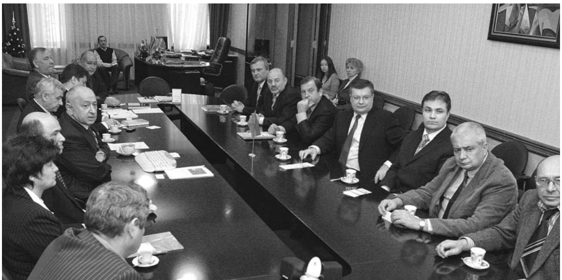
Dubna, 19 December. A delegation from Ukraine headed by Ambassador Extraordinary and Plenipotentiary of Ukraine to the Russian Federation, First Deputy Secretary of the Ukrainian Council of National Security and Defense Konstantin Grishchenko on a visit to JINR. At the Institute Directorate