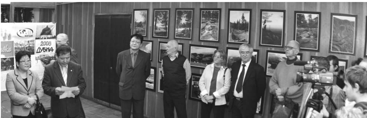
Dubna, 23 November. Culture Centre «Mir». The opening ceremony of the photo exhibition dedicated to the 800th anniversary of the establishment of the Mongolian state