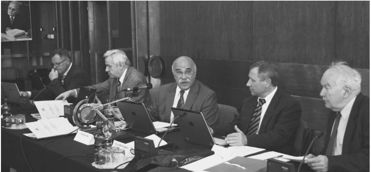
Dubna, 10–11 June. Meeting of the Programme Advisory Committee for Particle Physics