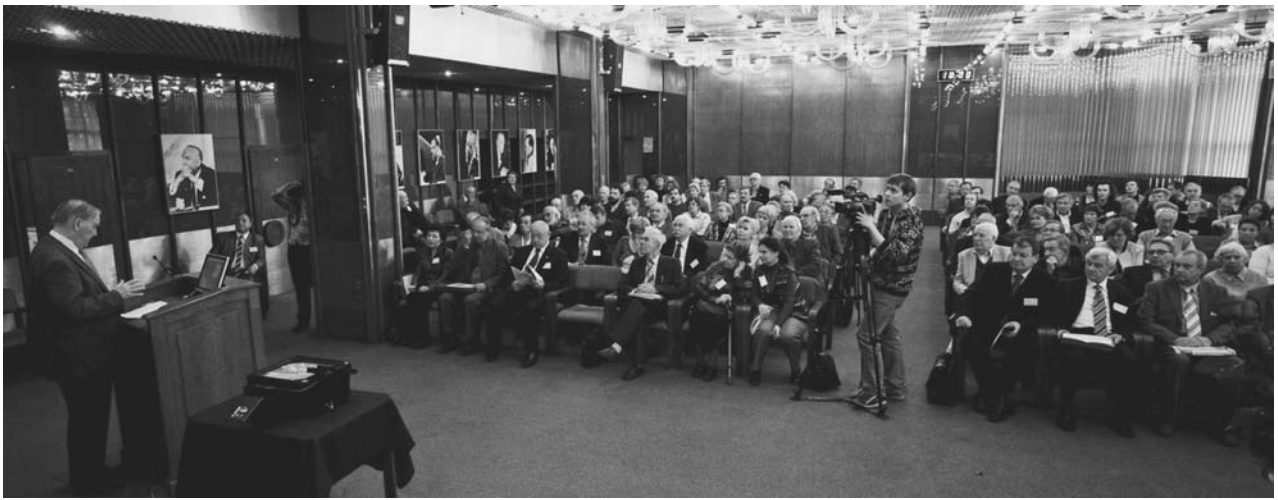
Dubna, 23–24 October. International seminar dedicated to the centenary of the birth of the Nobel prizewinner Academician I. Frank