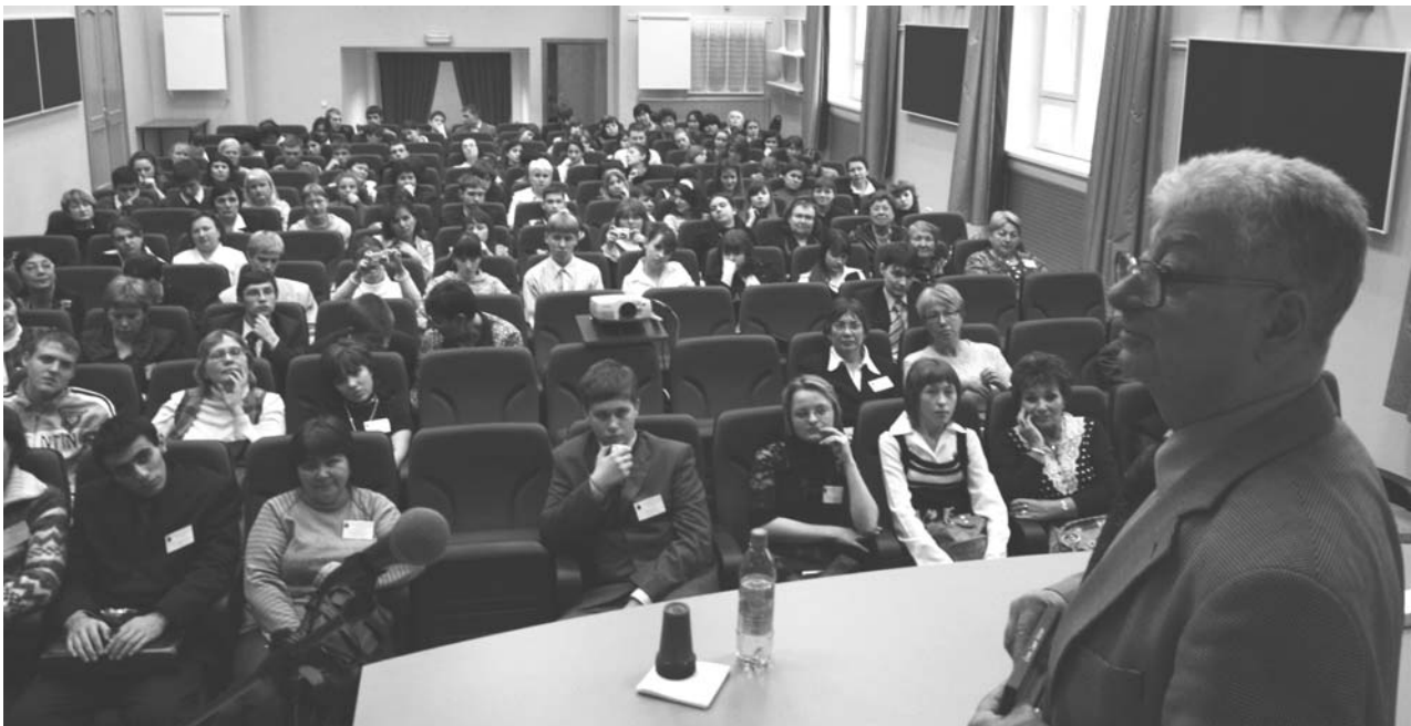
Moscow, 10 February. Scientific Leader of the Flerov Laboratory of Nuclear Reactions RAS Academician Yu. Oganessian gives a lecture at the Polytechnic Museum