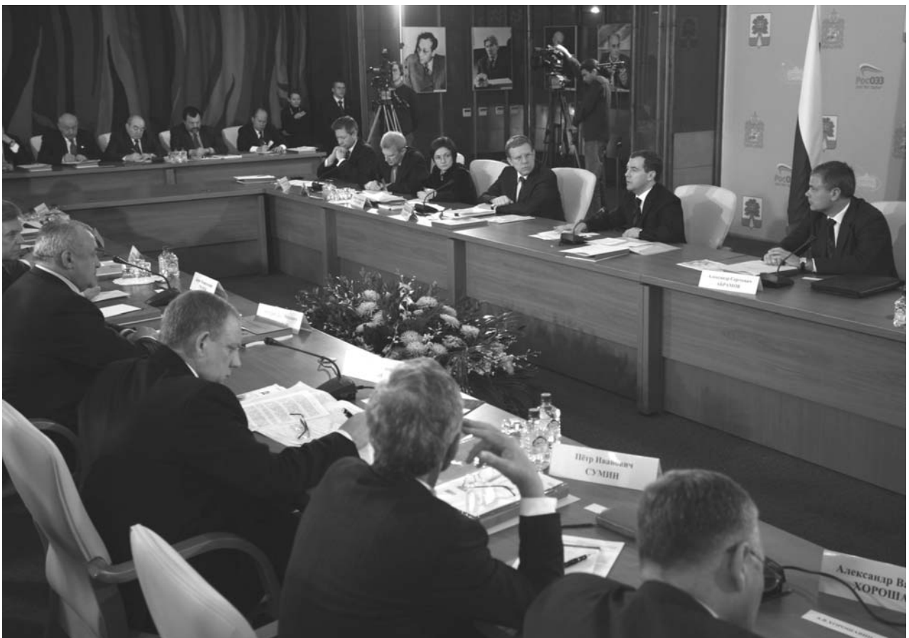
JINR International Conference Hall. Session of the RF State Council Presidium