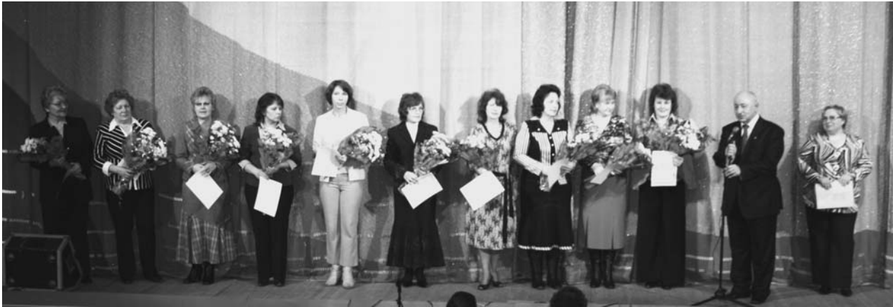
Dubna, 15 March. JINR scholarships are presented to the best teachers of the city for their excellent skills in pedagogics