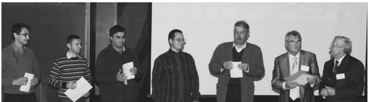
Dubna, 25–26 September. The 104th session of the JINR Scientific Council