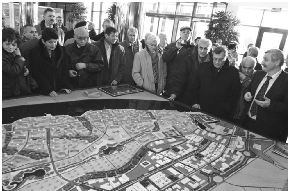
Dubna, 21–22 November. A regular session of the Committee of Plenipotentiaries of the Governments of JINR Member States