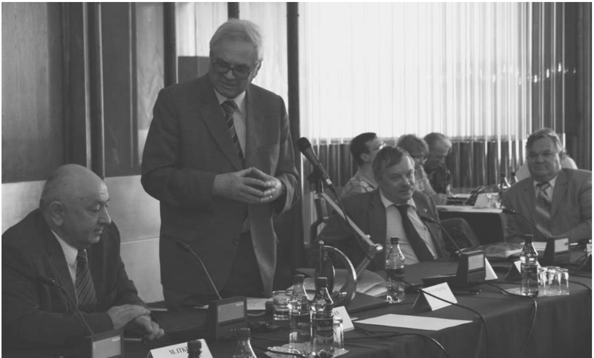
Dubna, 16–17 June. Meeting of the Programme Advisory Committee for Condensed Matter Physics